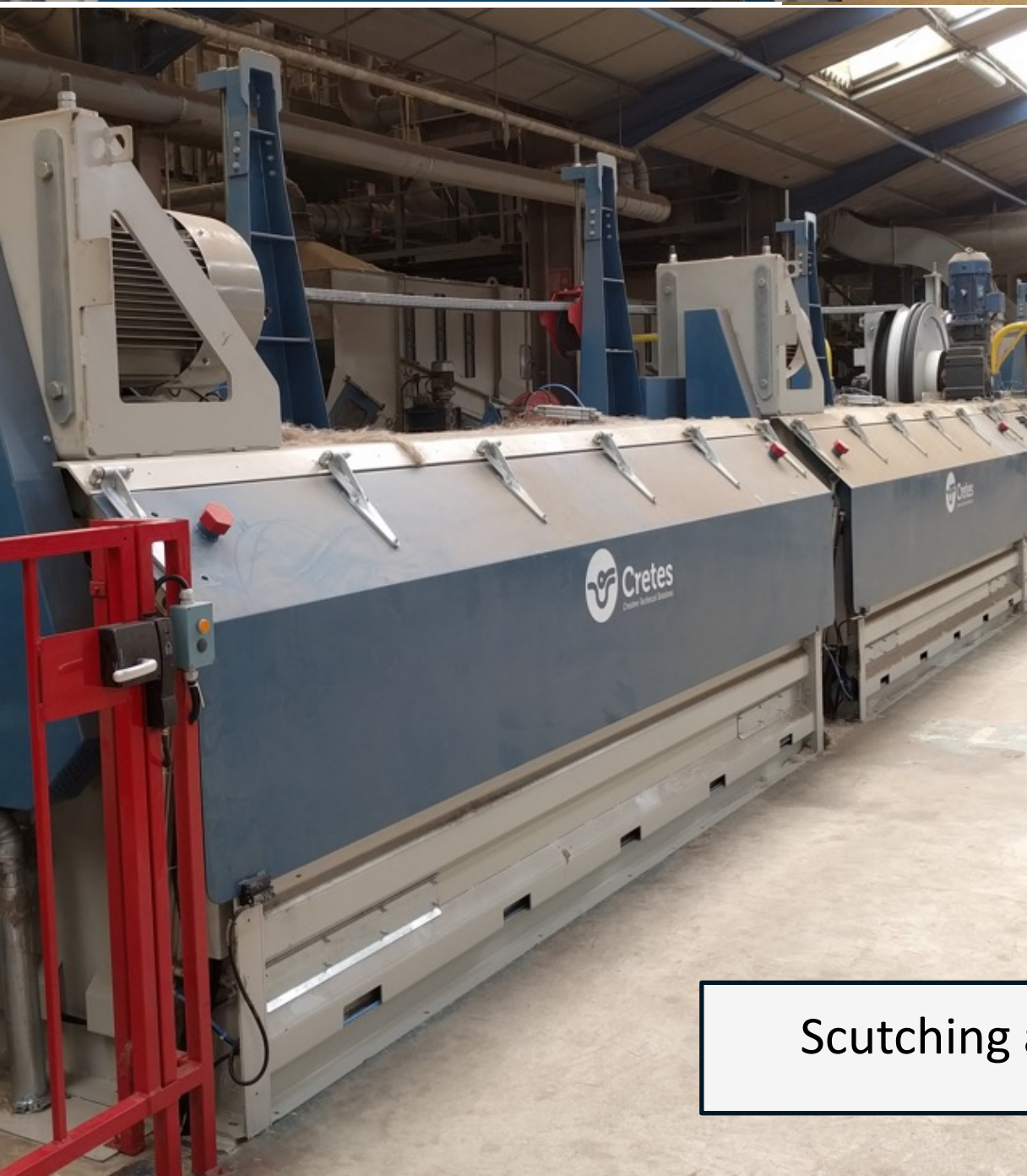
Scutching and fibre exit